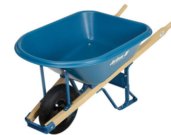
GARDEN CARTS & WHEELBARROWS