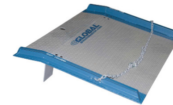
DOCK & TRUCK EQUIPMENT