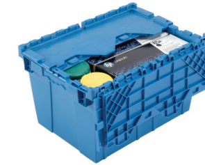
BINS, TOTES, & CONTAINERS