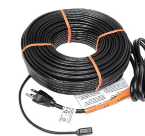
PIPE FREEZE/ROOF & GUTTER DE-ICING