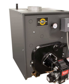
BOILERS, FURNACES, & HYDRONIC ACCESSORIES