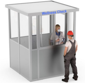
WELLNESS CHECK STATIONS