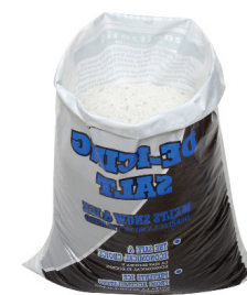
ICE MELT & ROCK SALT