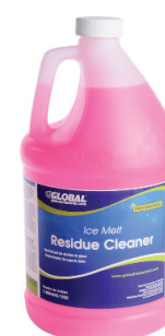
ICE MELT RESIDUE CLEANERS