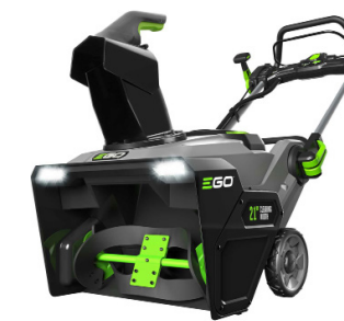
SNOW REMOVAL TOOLS