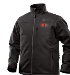
COLD WEATHER PROTECTION