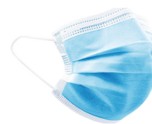
DISPOSABLE FACE MASKS