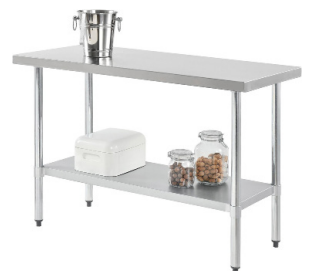
STAINLESS STEEL WORKBENCHES