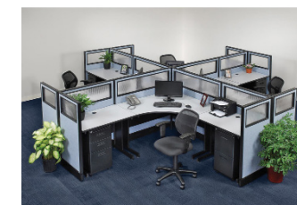
OFFICE PARTITIONS & ROOM DIVIDERS