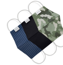
REUSABLE FACE MASKS