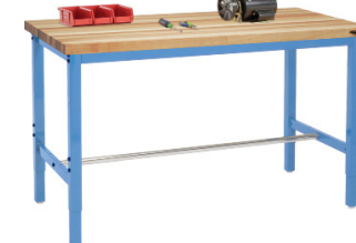
ADJUSTABLE HEIGHT WORKBENCHES