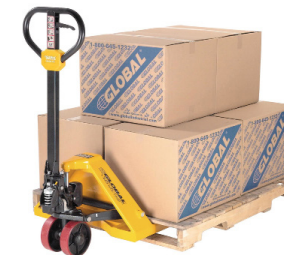
PALLET TRUCKS & JACKS