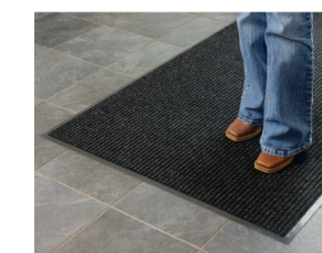
ENTRANCE & FLOOR MATS