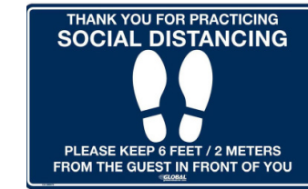
SOCIAL DISTANCING SIGNS