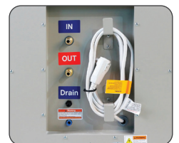
Water inlet and outlet with quick connect fittings