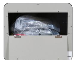
Onboard hose storage