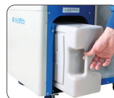
Convenient access to condensate tank