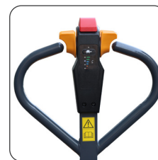
Ergonomic Features Reduce Fatigue