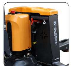
Durable Steel Construction