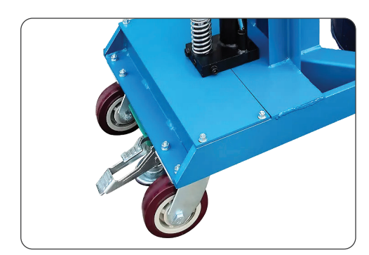
Includes (4) polyurethane swivel casters

Ideal for use in warehouses, factories, manufacturing facilities, and more