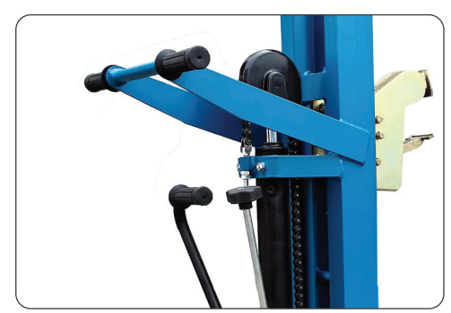
Ergonomic grip handle and height control knob