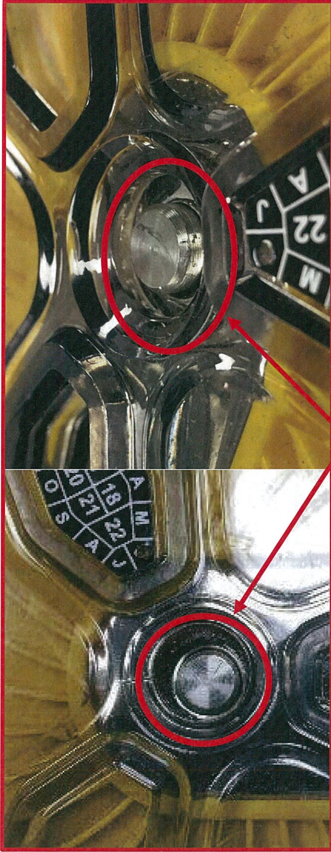
Figure 3 – Unflared Shaft End