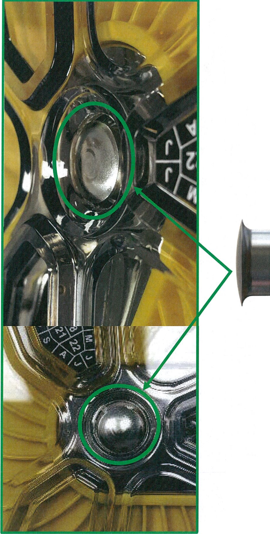
Figure 2 – Flared Shaft End